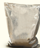
Pouch Low Sodium All Natural Black Beans In Brine